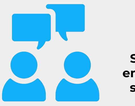
Social & emotional support